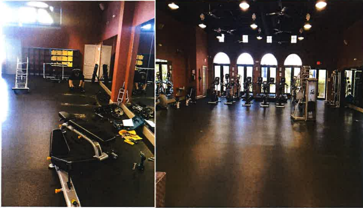
Deep Clean of the gym flooring took place overnight